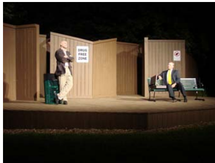
SummerStage's Production of "The Man with the Plastic Sandwich," September 2007