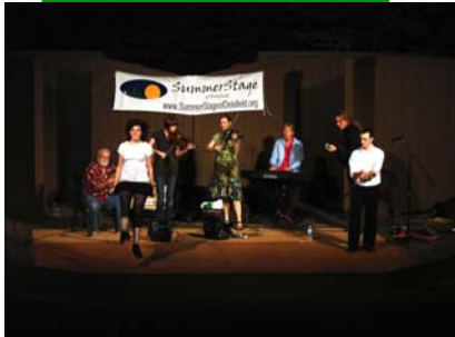
An Evening of Irish Music and Dance (July 2008)

the next level. SummerStage has directly produced much of the work presented thus far. We remain, however, committed to making the facility more user friendly and more available to other groups of artists who wish to produce and perform. 2009 will see more Theater Music and Dance on our Stage in the woods. Plan to attend. Your patronage will contribute to what I believe, will soon be a Lake Country tradition. Bring your chair and pick a good spot. The show is about to begin!