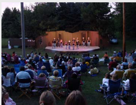
Dance group using SummerStage for their annual performance (August 2008)

If you're interested in using SummerStage, contact one of our board members. Please check our website for more information on the use of SummerStage.