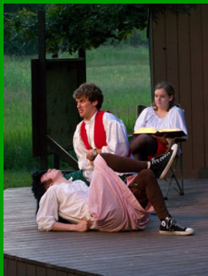
The Compleat Works of Shakespeare - Abridged (June 2008)

“SummerStage was started in 2006 with the thought of having a great outdoor venue for showcasing the performing arts.”