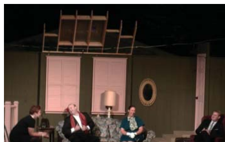
Barefoot in the Park