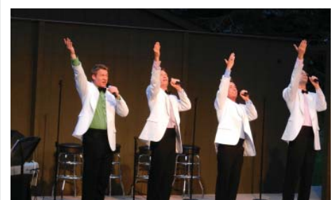
Four Guys in Dinner Jackets

And our most popular event of the season was "Four Guys in Dinner Jackets" who gave very entertaining renditions of many of the 1950's and 60's hits.