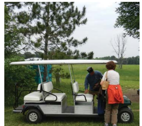
Transport Cart Dropping off Patrons

We are also looking for help funding our transport cart to carry our elderly and handicapped patrons to and from the stage