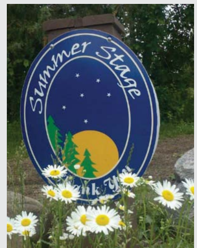
Welcome to SummerStage

Other non-profits that held fundraisers at SummerStage included, AngelsGrace Hospice, Lake Area Free Clinic, Friends of Lapham Peak, and Lynn's Legacy of Hope.