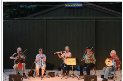
Ceol Cairde at An Evening of Irish Music & Dance the Cashel-Dennehy Dancers .

We had some great musical events, including are ever popular "Evening of Irish Music and Dance" featuring the bands Rira and Ceol Cairde and