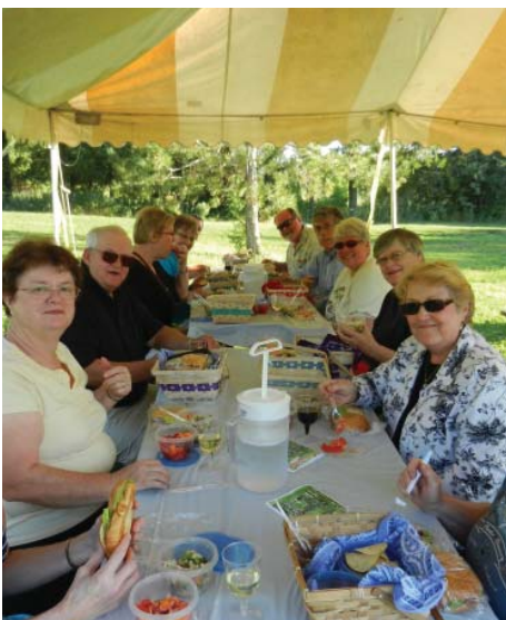
Picnickers Enjoying Our Covered Picnic Area